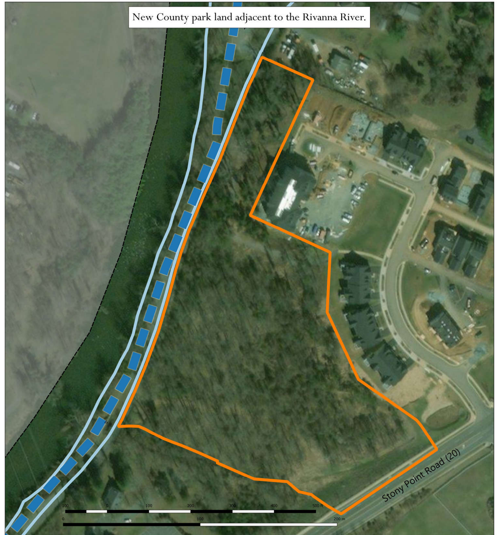
New County park land adjacent to the Rivanna River.