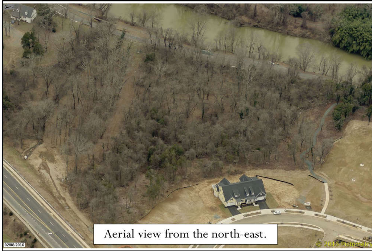
Aerial view from the north-east.

Prepared by Albemarle County, David Fox 4-24-2018. The map elements depicted are graphic representations and are not to be construed or used as legal description. This map is for display purposes only.