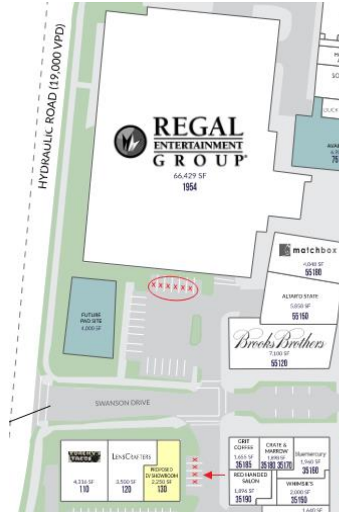
Fig. 1: Left: Location of proposed outdoor sales, storage and display parking spaces within the Stonefield Town Center. Right: Proposed Tesla parking plan.