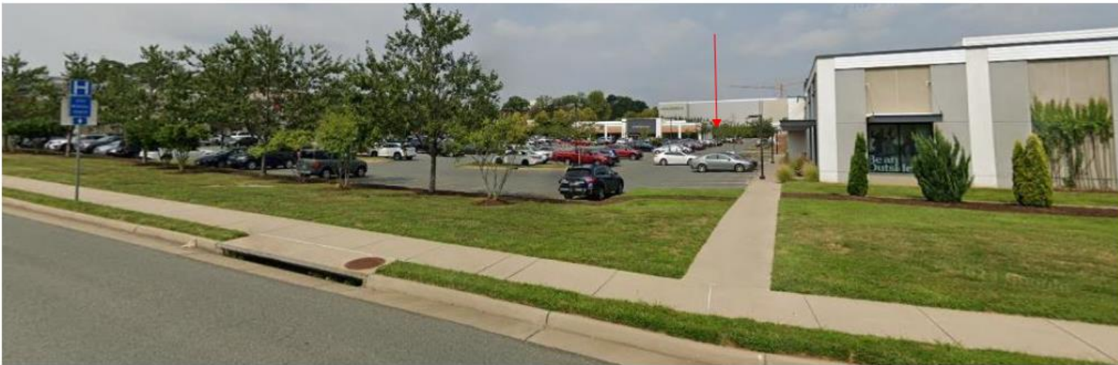
Fig. 2: View of 4-space parking area from the Rt. 29 Entrance Corridor.