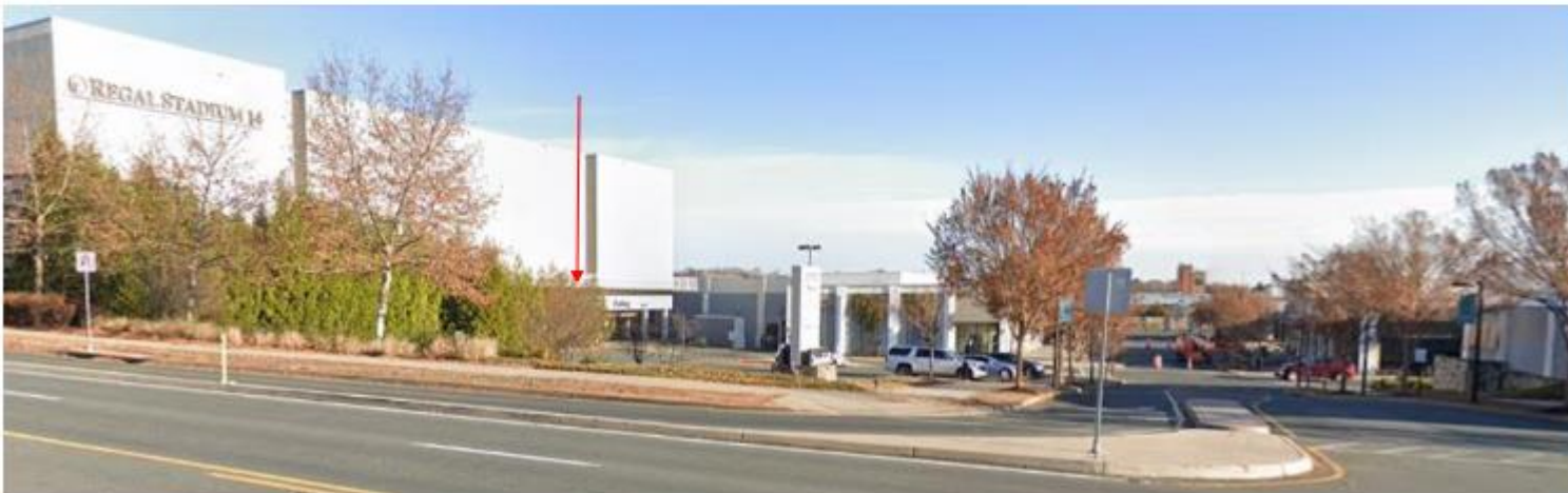
Fig. 3: View of 6-space parking area from the Hydraulic Rd. Entrance Corridor.