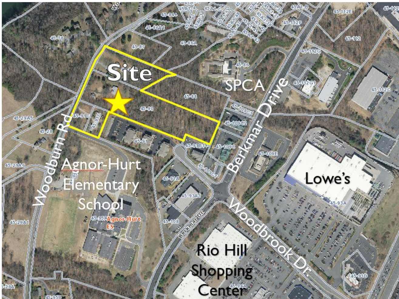
Figure 1: Aerial Map

The surrounding area comprised residential, educational, office, and commercial uses. The immediate adjacent properties consist of wooded property associated with the SPCA, Carriage Gate apartments, Agnor-Hurt Elementary School, and developed commercial properties. The areas where the rear setback would apply, the adjacent uses are a wooded buffer and a parking lot associated with a commercial use. These properties are currently zoned Commercial and Residential, and designated within the Places29 Master Plan as Urban Mixed Use around Centers, Urban Density Residential, and Institutional. See maps below.