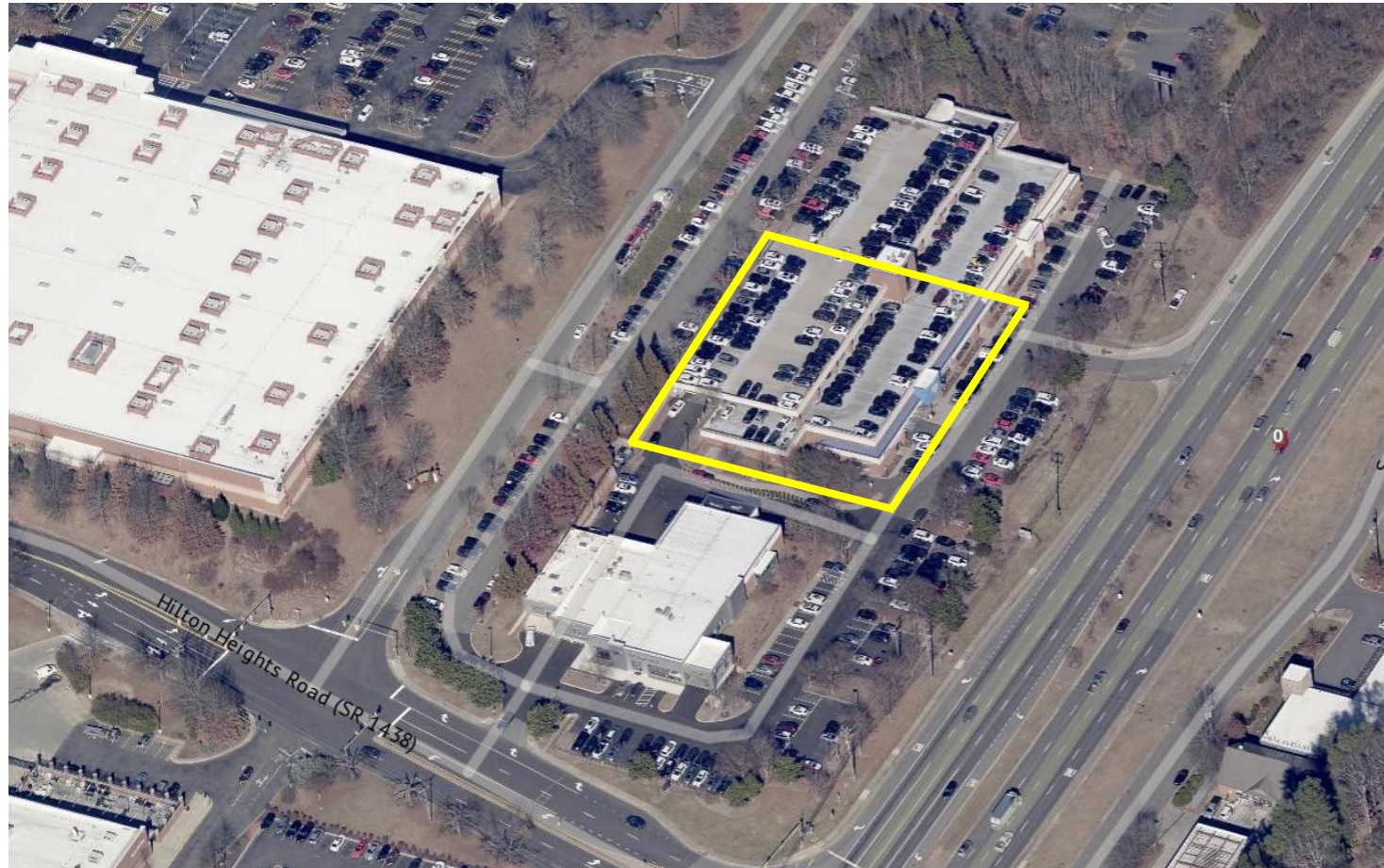
Figure 1: Aerial view highlighting the subject building.