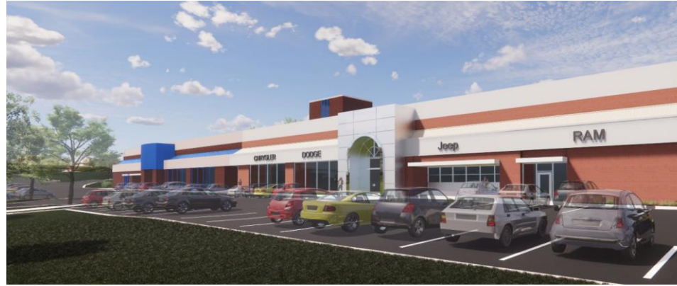
Figure 2: Approved Design for Flow CDJR.