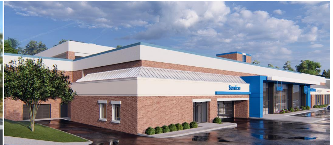
Figure 3: Honda national branding example (left). Proposed building design 4/15/2023 (right).