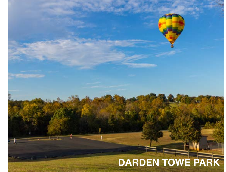
DARDEN TOWE PARK