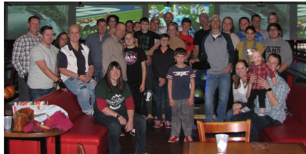
On Sunday December 5th, ACFR the Recruitment and Retention Committee held a Fire & EMS appreciation event at Kegler's Lanes. Approximately 40 members representing departments from across the Albemarle County system came out to enjoy an afternoon of bowling, food, and fellowship. Fun was had by all.

The R&R Committee plans to hold regular events to show appreciation for the service members provide to our community and to provide an opportunity to enjoy each other's company in a relaxing and fun environment. Be on the lookout for our next event!