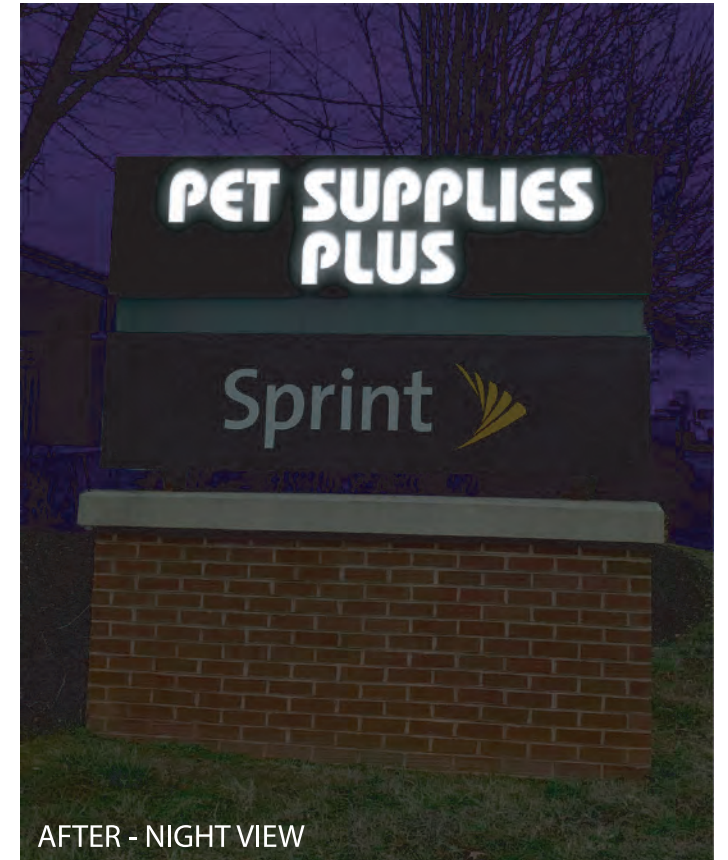
AFTER - NIGHT VIEW

NOTES: DIAGRAMS ARE SHOWN FOR REFERENCE ONLY. ACTUAL TENANT SIGNS WILL REFLECT INDIVIDUAL TENANT IDENTITY THROUGH SHAPE, FONT, ETC., SUBJECT TO EC GUIDELINES REGARDING SIZE, COLOR, PROPORTION, ETC. ALL SIGNS WILL REQUIRE INDIVIDUAL SIGN PERMIT APPLICATIONS