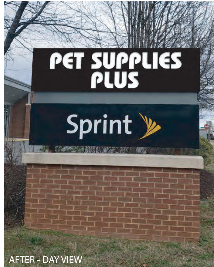
AFTER - DAY VIEW